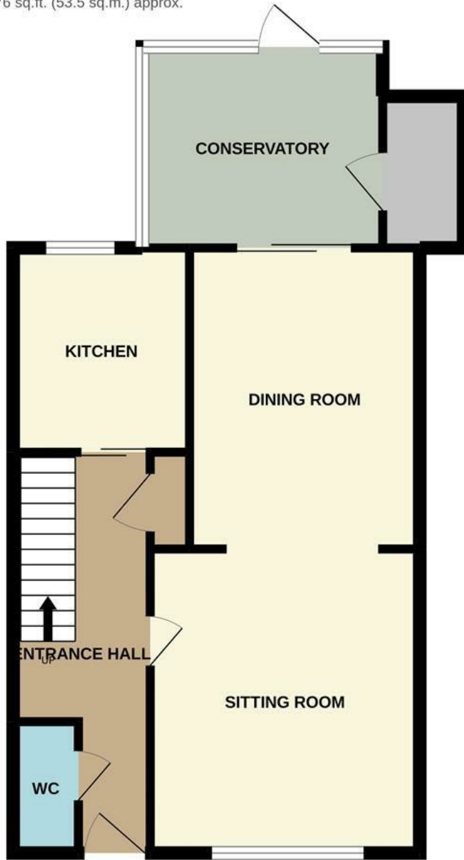
GROUND FLOOR 576 sq.ft. (53.5 sq.m.) approx.